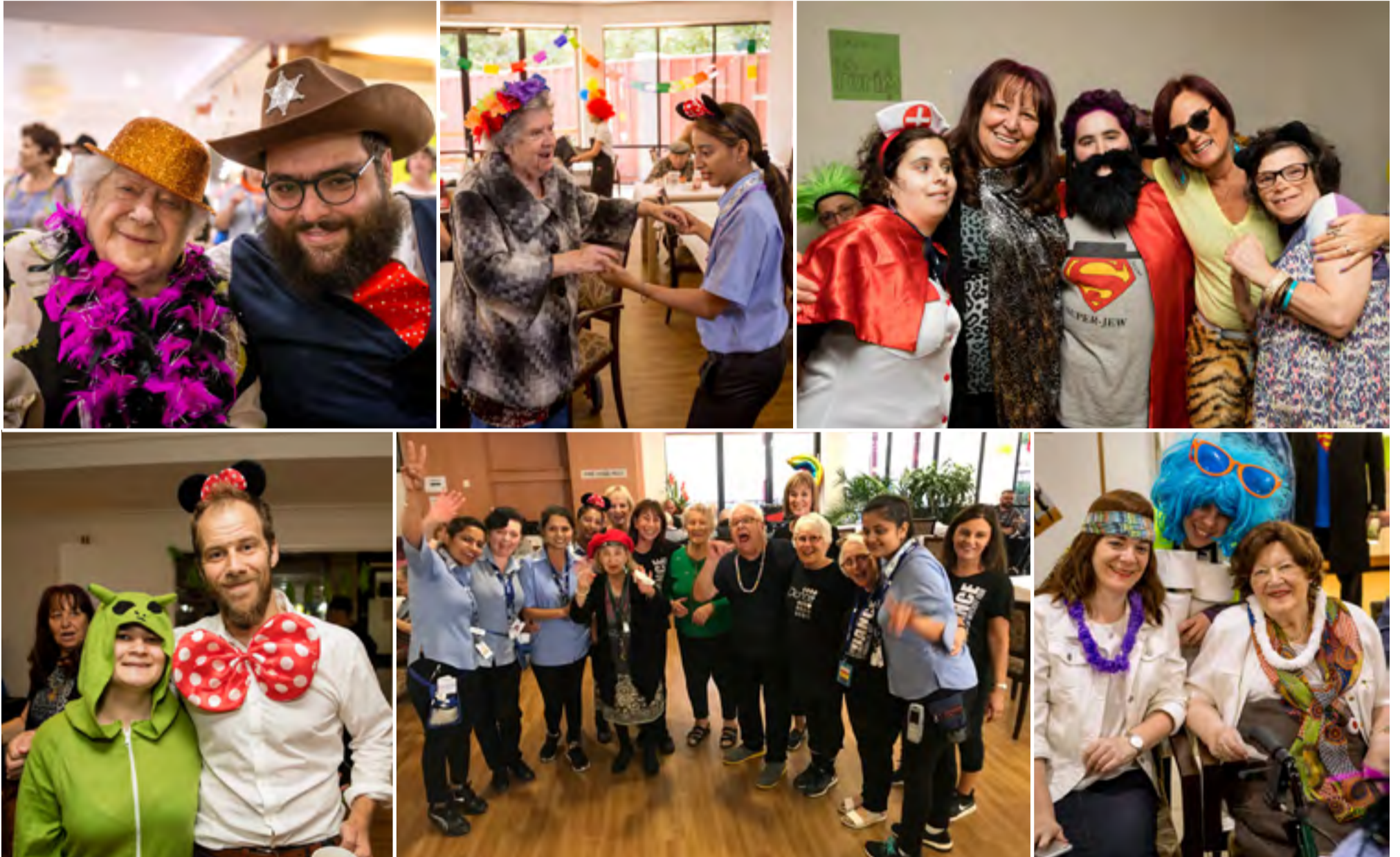
Purim festivities were a source of laughter and delight throughout our many facilities