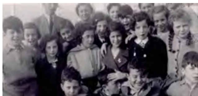
Jewish Care's Frances Barkman children