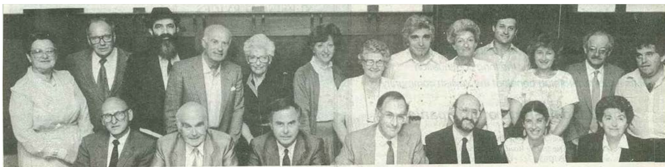
Members of the board of the Australian Jewish Welfare Relief Society in 1987

The couple's enduring commitment to Jewish Care helps to ensure that the delivery of vital services to all sectors of our community is secured for the future.