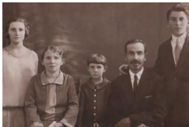
With parents and siblings following arrival in Australia.