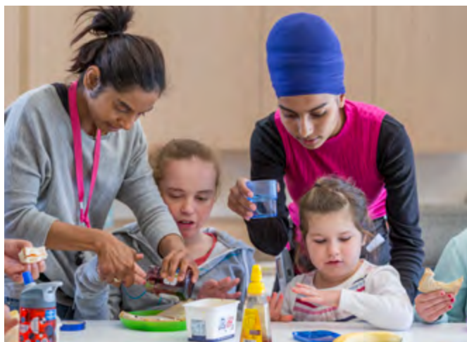
Lunchtime at The Coppel & Piekarski Family Disability Respite Centre.