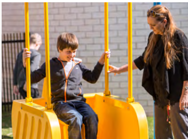
Enjoying a ride on our new Liberty Swing, generously donated by Friends of Montefiore.

Families are enjoying a well-deserved break, thanks to the wonderful new facilities offered by our The Coppel & Piekarski Family Disability Respite Centre.