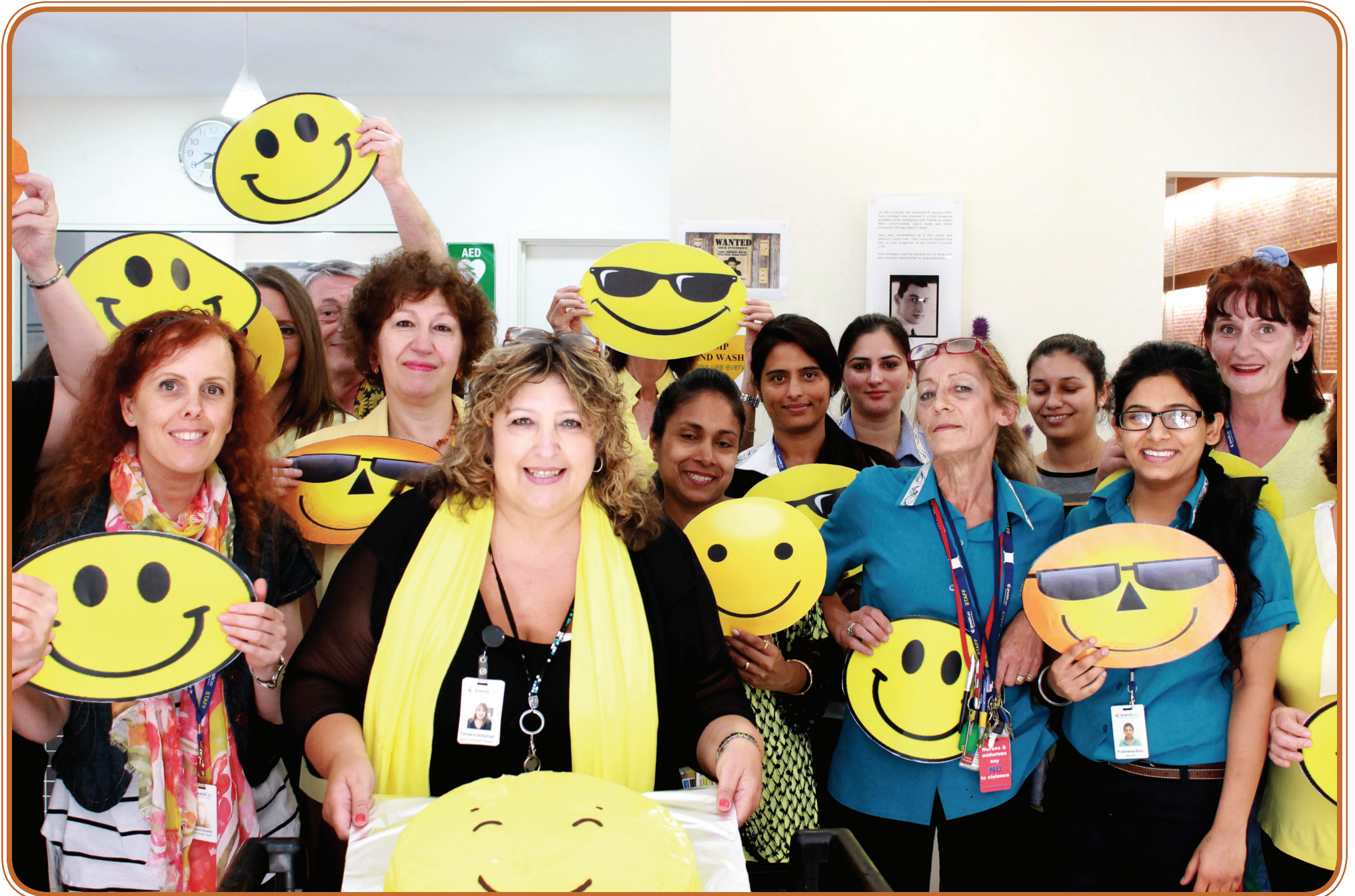
Staff at Jewish Care's Gary Smorgon House say thank you.