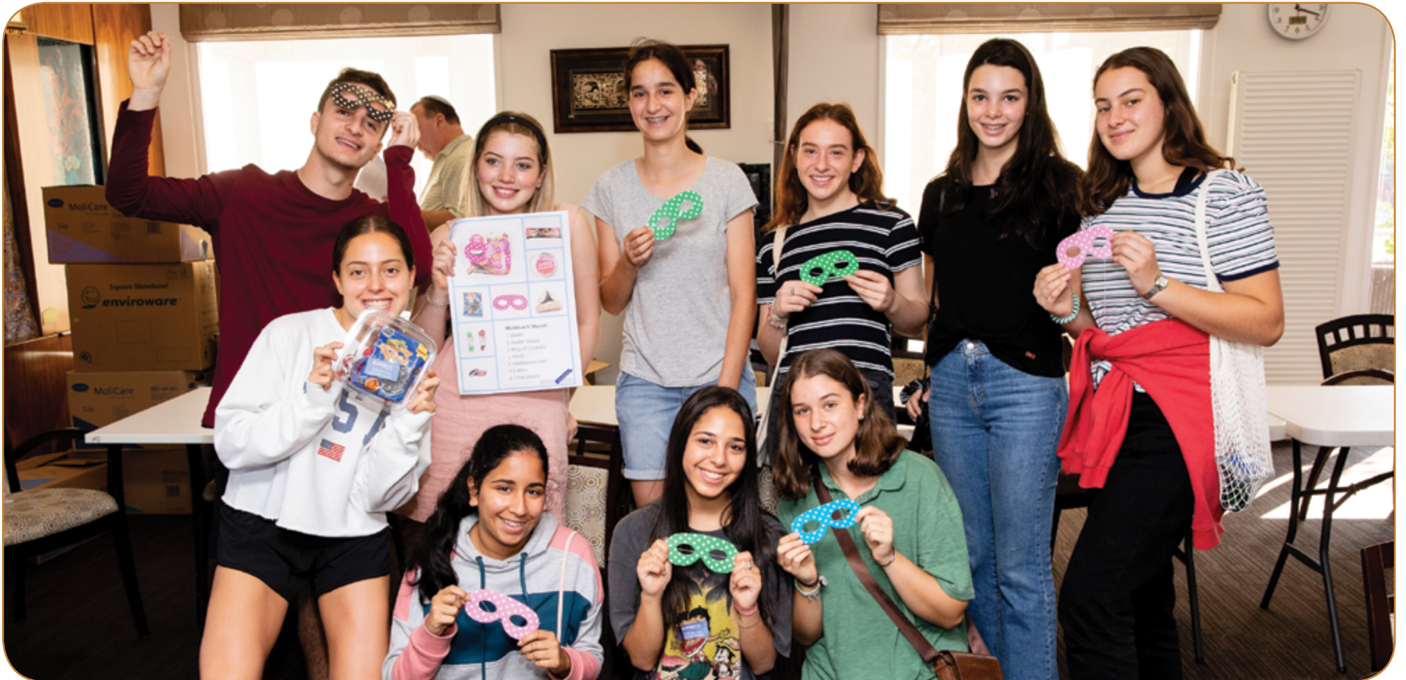
Young helpers at this year's Purim Packing Bee at Gary Smorgon House.