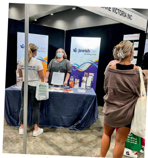
Jewish Care stand at the Disability Expo.

The theme and focal point for the Jewish Care stand was "Be Yourself". This sentiment underpins Jewish Care's unique approach offered to the community and ensures that each person is supported based on their individual needs. The dedicated Jewish Care team support people with disabilities to live their best life, their way.