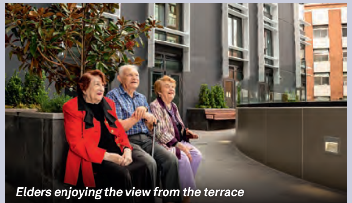
Elders enjoying the view from the terrace

This beautiful building will house 156 Elders, across three categories of living; Traditional, Classic and Choice, who will have access to some of the best communal spaces that the Jewish community is yet to experience. The spacious Synagogue, large dining and living spaces, winter gardens, sprawling balconies, and a vast courtyard are some of these unique features.