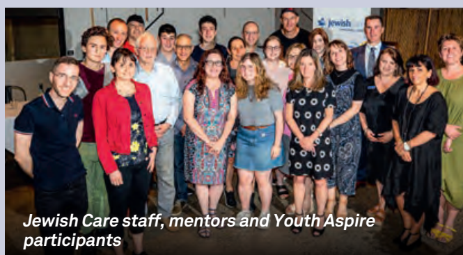
Jewish Care staff, mentors and Youth Aspire participants