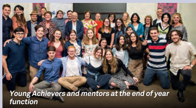
Young Achievers and mentors at the end of year function

During his time, Jewish Care also developed a strong focus on inclusivity, adopting formal position statements related to gender equity and equality, asylum seekers and refugees, safeguarding children, LGBTI+ inclusion, family violence, and people living with a disability.