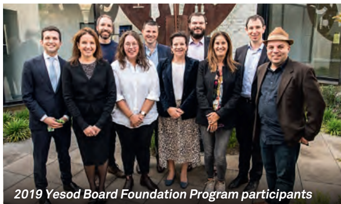
2019 Yesod Board Foundation Program participants

For more information about Yesod, visit jewishcare.org.au/yesod