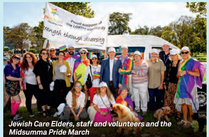
Jewish Care Elders, staff and volunteers and the Midsumma Pride March