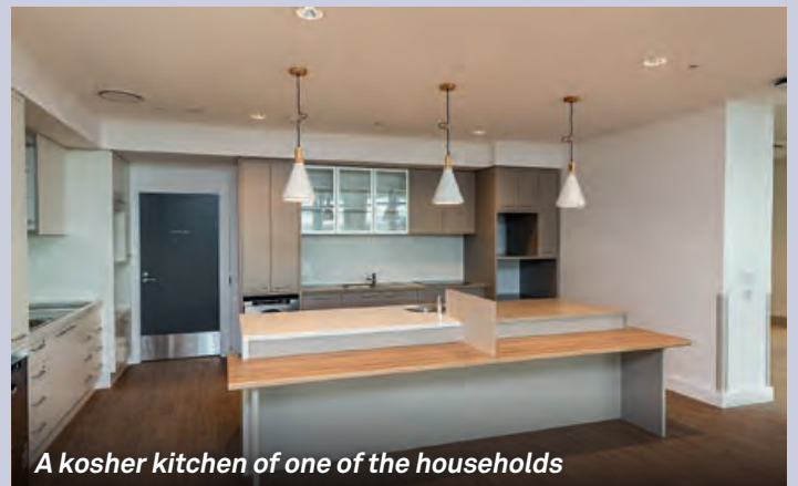
A kosher kitchen of one of the households