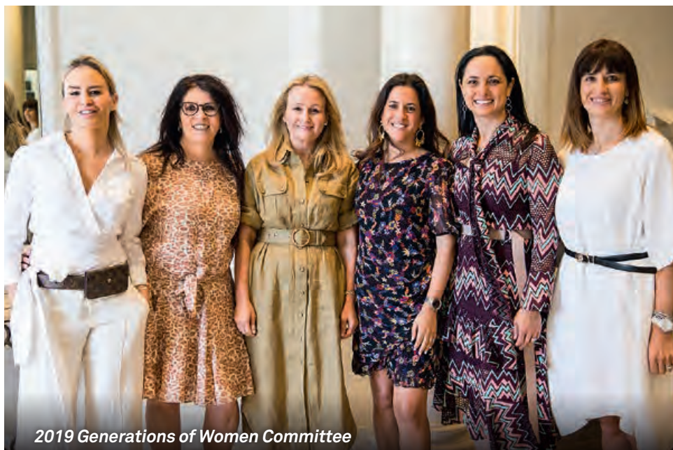
2019 Generations of Women Committee