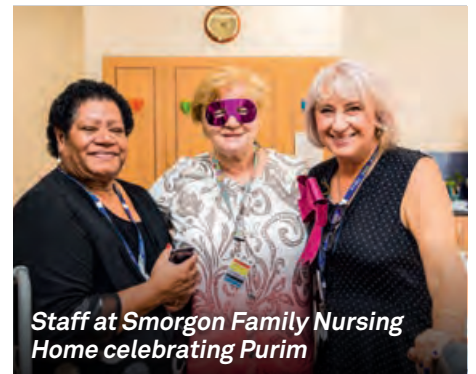
Staff at Smorgon Family Nursing Home celebrating Purim