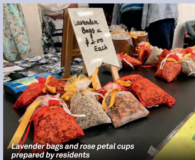
Lavender bags and rose petal cups prepared by residents

The residents were very pleased with the outcome and called it a fun, new experience.