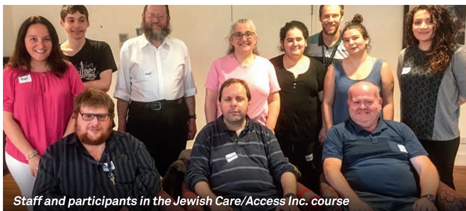
Staff and participants in the Jewish Care/Access Inc. course

i If you or someone you know is interested in participating, contact the Jewish Care Employment and Education Centre on 8517 5999