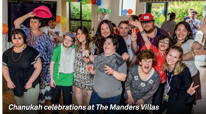
Chanukah celebrations at The Manders Villas

Purim was exceptionally colourful this year with vivid theme parties organised across all our facilities from shtetl and rainbow to superheros vs villains. It was a fantastic way to get our Elders, families and staff in the party spirit and enjoy the line-up of fun filled activities including megillah reading, photo booths, dancing and performances. Key highlights were the fashion show at The Manders Villas, a performance by 'The Splitters' at Smorgon and students of Beth Rivkah and Leibler Yavneh College visiting Montefiore Homes to join in on the fun.