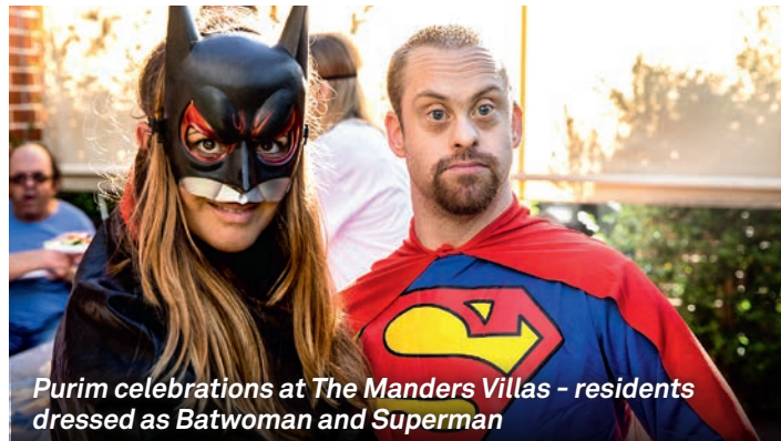
Purim celebrations at The Manders Villas - residents dressed as Batwoman and Superman