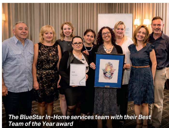
The BlueStar In-Home services team with their Best Team of the Year award