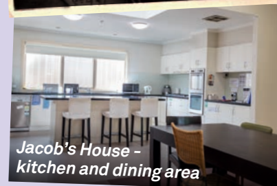
Jacob's House - kitchen and dining area