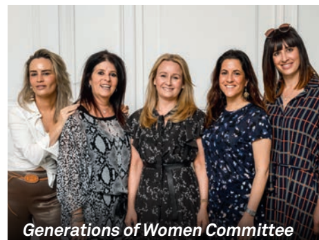
Generations of Women Committee