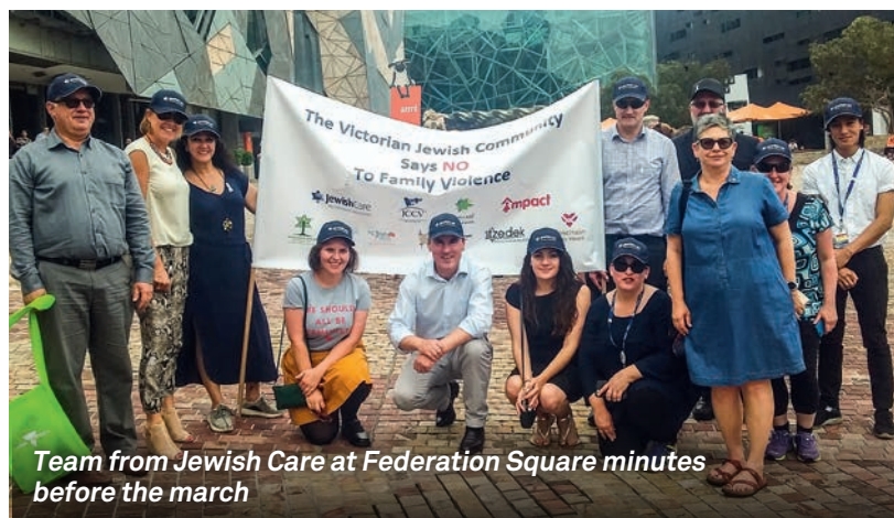
Team from Jewish Care at Federation Square minutes before the march

Nine leading Jewish organisations including Jewish Care, Jewish Community Council of Victoria, Tzedek, National Council of Jewish Women of Australia, Unchain My Heart, Maccabi, Progressive Judaism Victoria, Impact and the Rabbinical Council of Victoria teamed up to send a clear message that the Victorian Jewish community stands united in saying 'No' to family violence at the Walk Against Family Violence.