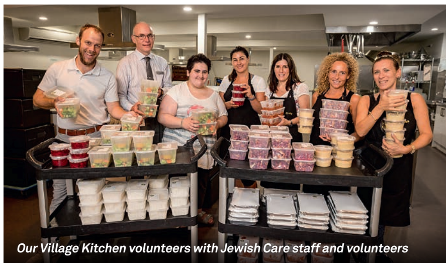
Our Village Kitchen volunteers with Jewish Care staff and volunteers

This is a fantastic example of the community joining hands and banding together to care for those in need in our community. We hope these meals will provide some relief to our community members who are unable to afford healthy and culturally appropriate meals during Shabbat.