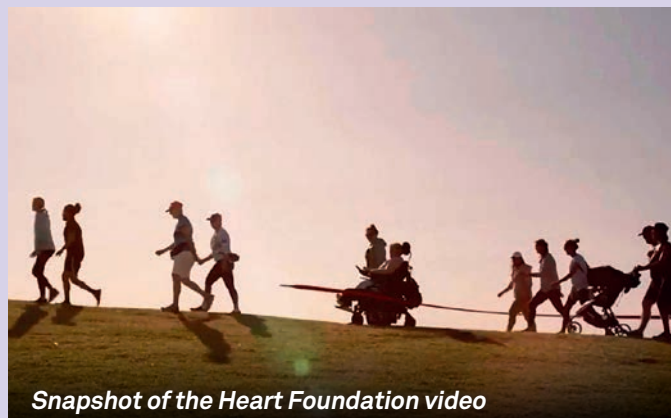
Snapshot of the Heart Foundation video

Watch the Heart Foundation commercial https://youtube/rq9aKZyshBI