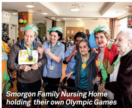
Smorgon Family Nursing Home holding their own Olympic Games