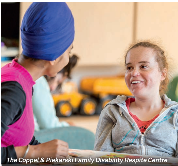
The Coppel & Piekarski Family Disability Respite Centre