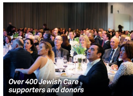
Over 400 Jewish Care supporters and donors