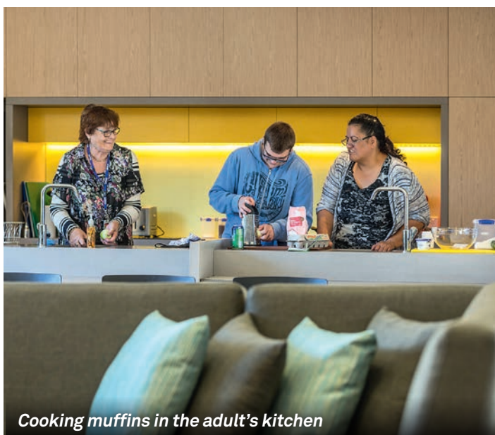
Cooking muffins in the adult's kitchen