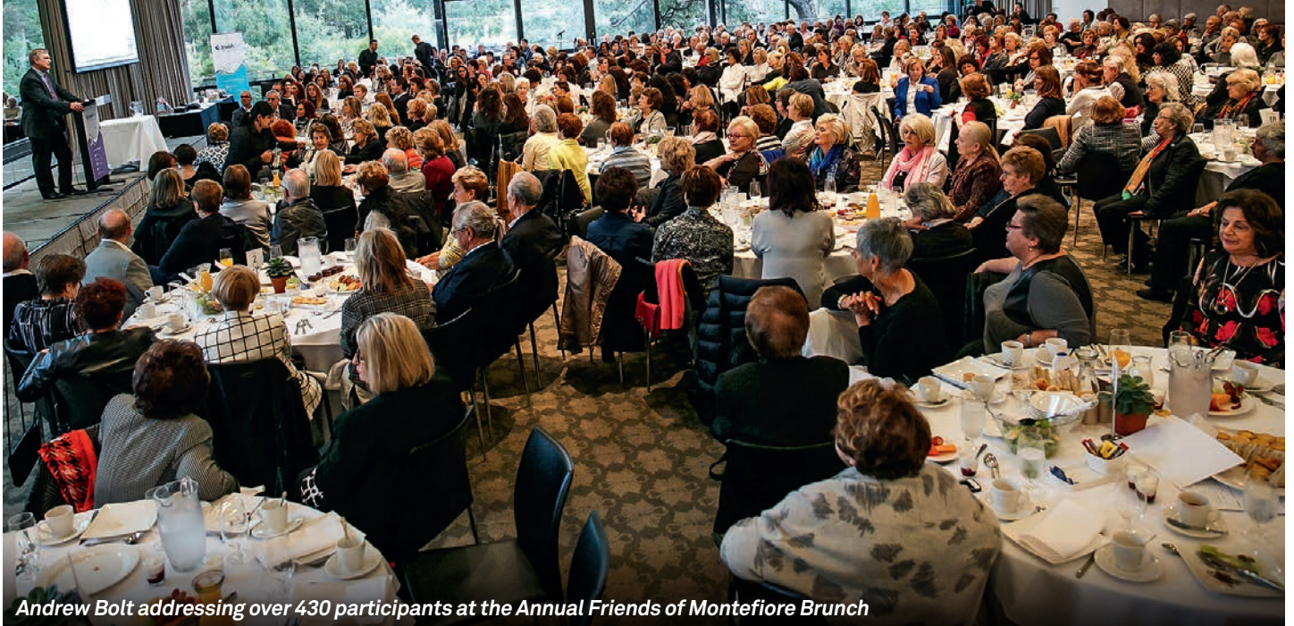
Andrew Bolt addressing over 430 participants at the Annual Friends of Montefiore Brunch