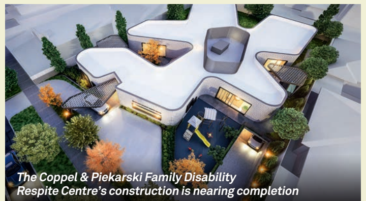
The Coppel & Piekarski Family Disability Respite Centre's construction is nearing completion

In line with our strategy to provide a Healthy Ageing service in the southern region, we have commissioned architects Design Inc to commence high level architectural drawings for a new Active Living Centre extension to Gary Smorgon House.