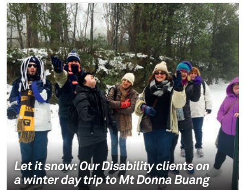
Let it snow: Our Disability clients on a winter day trip to Mt Donna Buang