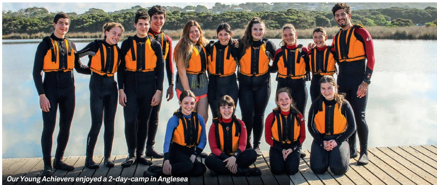
Our Young Achievers enjoyed a 2-day-camp in Anglesea