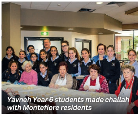
Yavneh Year 6 students made challah with Montefiore residents