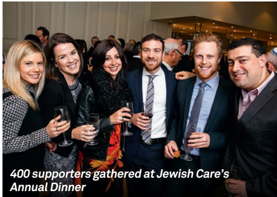
400 supporters gathered at Jewish Care's Annual Dinner

Individuals and families were supported to manage multiple and complex needs such as domestic violence or child abuse