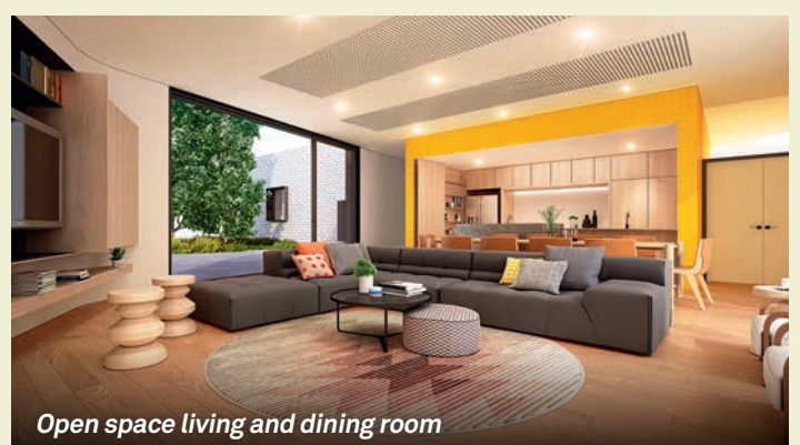
Open space living and dining room