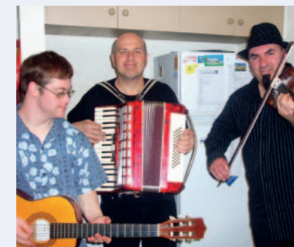
Prahran Grove was opened in 2007 to provide supported accommodation for adults with a disability.