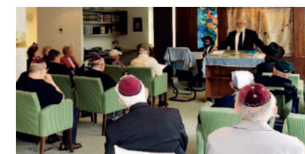
Gary Smorgon House's Beit Shlomo is the community's newest shul.

neighbourhood joining residents for Shabbat prayer services and the tantalizing kiddush which follows.