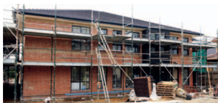
The soon to be opened Glen Eira Road development.

two years, in conjunction with local government and South East Water, we have achieved a 45% reduction in water consumption by improving infrastructure, maintenance and procedures, and introducing drought-tolerant landscaping.