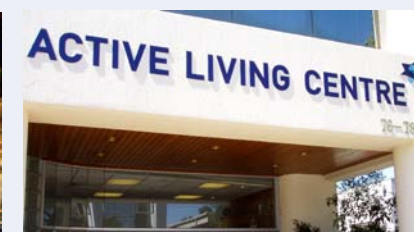
Activities for older people were consolidated with the opening of the Active Living Centre on Kooyong Road.