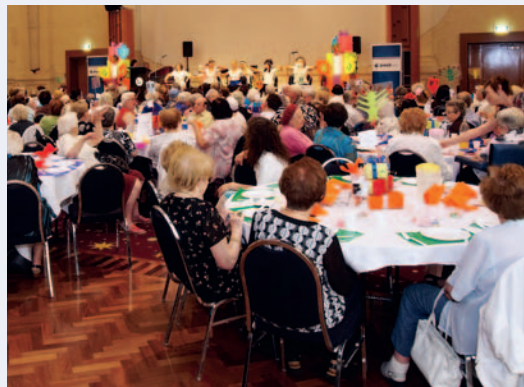
More than 200 people attended the Active Living Centre's Chanukah party at St Kilda Town Hall.