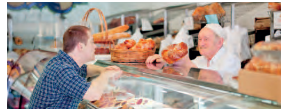
Glen Eira Villas is located in the heart of our community.

We need your help to bridge the remaining $1.5m shortfall. Please consider aligning yourself with the vision of Glen Eira Villas. By investing in naming rights, your family name will be synonymous with a leading edge community project that embodies the qualities of compassion, freedom, equality and social justice.