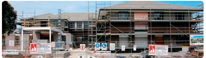
The Gary Smorgon House construction site on Freeman Street, Caulfield.

For more information please visit our dedicated website www.garysmorgonhouse.com.au