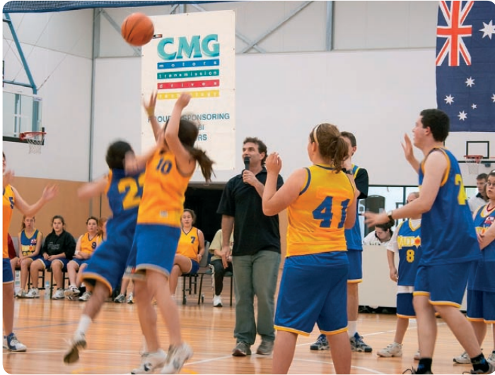
The all-abilities Dolphins basketball team in action.