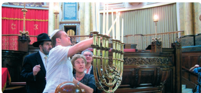
A resident of Jewish Care's Supported Accommodation Homes lights the menorah at the Melbourne Hebrew Congregation.

To commemorate the occasion, a generous gift of challah covers was presented on behalf of the Melbourne Hebrew Congregation to each of Jewish Care's Supported Accommodation Homes.