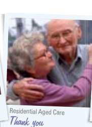
Residential Aged Care Thank you