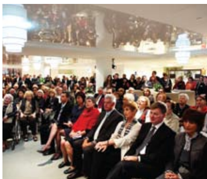
Guests at the Grand Opening of Gary Smorgon House.