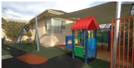
The newly refurbished Children's Respite house.