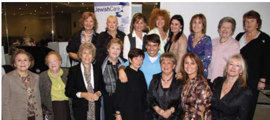
Peter Alexander poses with the Friends of Monte organising committee.

Two hundred women joined Peter Alexander on May 6 for a special fundraising event hosted by Jewish Care's Friends of Montefiore.