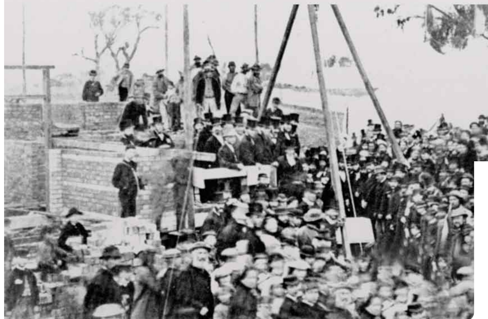
The first steps were taken in 1870 with the laying of the Foundation Stone of Montefiore Homes for the Aged, on the same site where Jewish Care stands today.